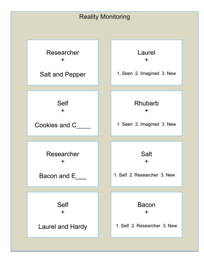
Fig. 1 — Stimuli used in the Reality Monitoring Tasks. Note: Sample stimuli used in the study phase (left) and test phase (right) of the reality monitoring task. In a 2 \times 2 design, either the subject or experimenter spoke aloud the stimuli, which were presented either complete (perceived) or incomplete (requiring the second word to be imagined). Subjects were then presented at test with the first word of a word pair, and asked to judge whether the accompanying word had been seen or imagined, or if the presented word was new; or whether the subject or experimenter had read aloud the word pair, or the presented word was new.

Reality monitoring task – The task was adapted from one used previously (Simons et al., 2006; Simons et al., 2008) and involved the initial presentation of word-pairs followed by a test phase. In the test phase, the participant was asked to indicate whether a word had earlier been presented within an intact word-pair using the response 'Perceived', or had been presented in a word-pair which had needed to be completed by imagining the missing word, with the response 'Imagined'. Participants were also required to judge whether the wordpair had previously been spoken aloud by themselves ('Subject' response) or was spoken by the researcher ('Experimenter' response). Previously unstudied words were also used in the test phase, requiring a 'New' response. The stimuli consisted of 216 well-known word-pairs (e.g., 'Laurel and Hardy', 'Bacon and Eggs'), which were pilot tested for the current study to ensure their familiarity among adults in the target demographic range. The task comprised 6 separate study and test blocks, with 24 word-pair stimuli in each study phase (six word-pairs presented in four combinations of Subject/Experimenter × Perceived/Imagined conditions; Fig. 1) and an additional 12 new words included in the test phase.