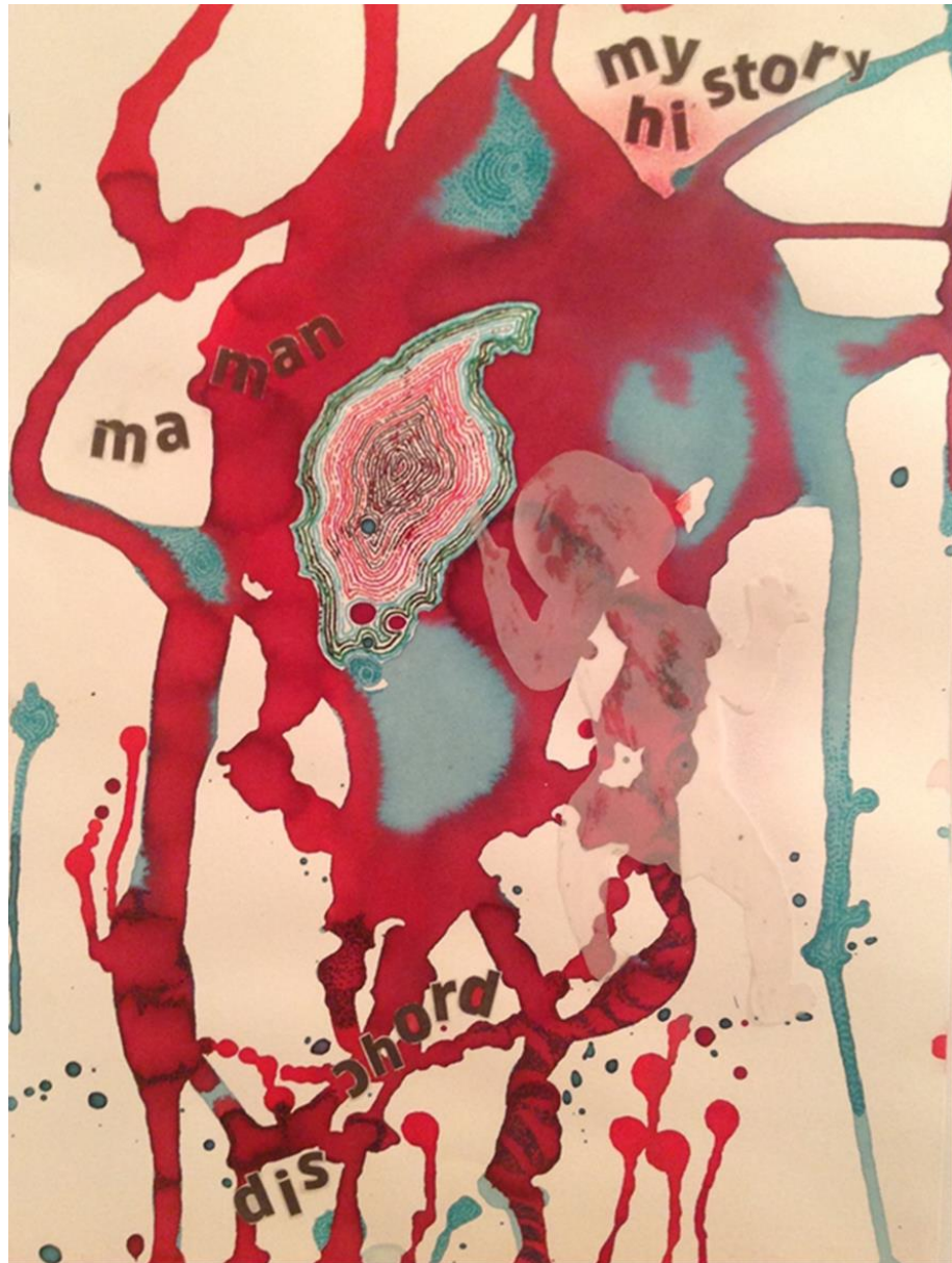
Figure 4: 'dis chord' (Calonder, 2015)

image of the baby (an image created by Adam Fuss in 1992) can be seen rooting for the breast. Significantly the image of the baby is called 'Invocation' suggesting the presence of something other worldly, spiritual or godly.