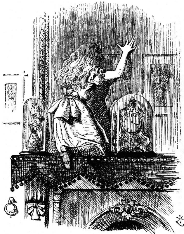
Figure 1: 'Alice Going through the Looking Glass' (Tenniel, 1976)

"All too much here and barely there, birth stories embody in miniature long and wide histories of sometimes violent knowledge practices. They reproduce maternal subjects." (Pollock, 1999)