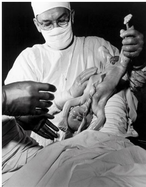
Figure 3: ‘Special Delivery’ (Miller, 1955)

“Safety and consumer ideology interpenetrate with the veneration of technology, the institution, and patriarchy in such a way that they become located in the hospital and embodied in the doctor, whose tools and technological expertise become the safe fetal space to be purchased by expectant mothers. Her eyes extended by ultrasound, her hands by the scalpel and laparoscope, her brain linked to databases of the latest clinical research, the cyborg obstetrician seems to guarantee the perfectly predictable product - baby. How can a conscientious pregnant consumer justify buying anything less?” (Wendland, 2007, p. 225).