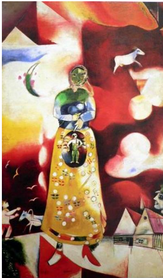
Figure 5: 'Pregnant Woman' (Chagall, 1913)