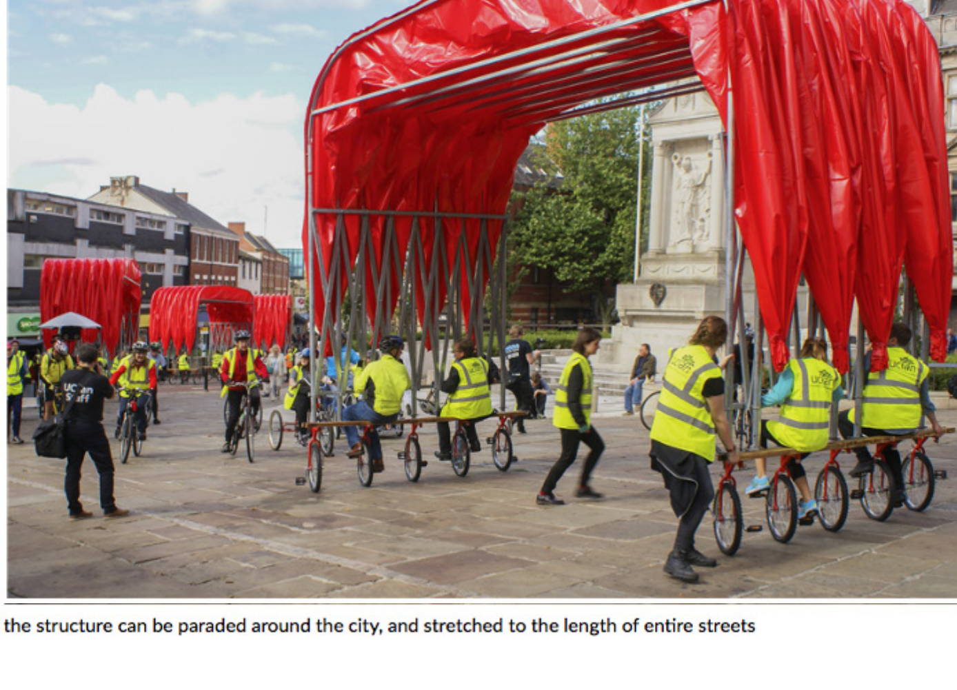
the structure can be paraded around the city, and stretched to the length of entire streets

the design was first commissioned by the city of preston in the UK and in certain places, an art program for urban intervention and events. the aim of the program is to re-energize the city's grand but declining historic center. urban sprawl and air conditioned shopping malls have driven residents away from the open streets and public spaces of the rainy city. the design references expandable canopies popular in southern china typically used by small businesses like restaurants and bars to temporarily expand their spaces into parking lots and public sidewalks.