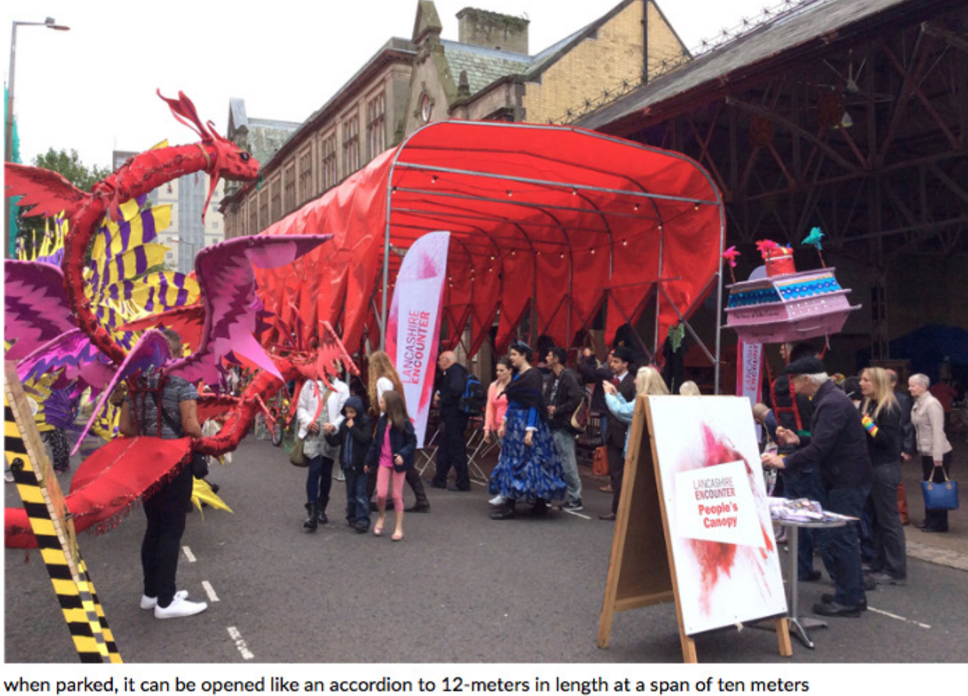
when parked, it can be opened like an accordion to 12-meters in length at a span of ten meters

following their debut in preston, the 'people's canopies' were features in the 2015 bi-city biennale of urbanism/architecture in hong kong. installed in kowloon park, they were continually relocated, expanded and contracted to support various public activities. events were planned for the canopies but the public was also encouraged to engage in unexpected ways.