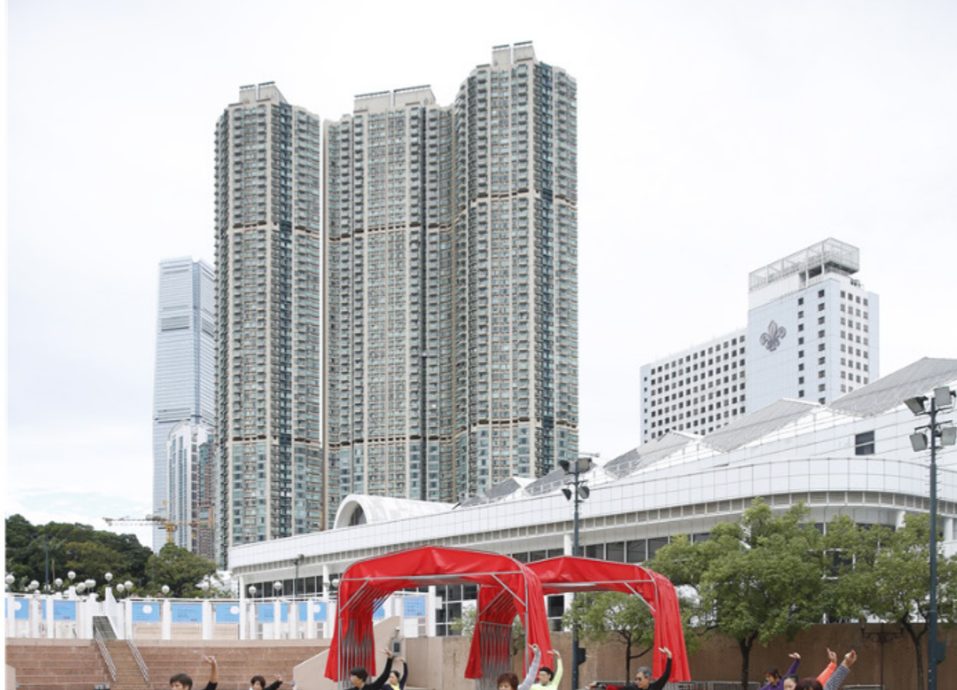
the canopy can collapse to the size of a double-decker bus