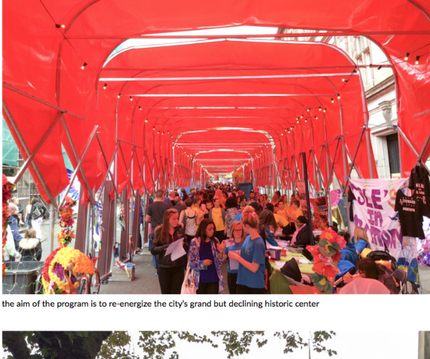
the aim of the program is to re-energize the city's grand but declining historic center