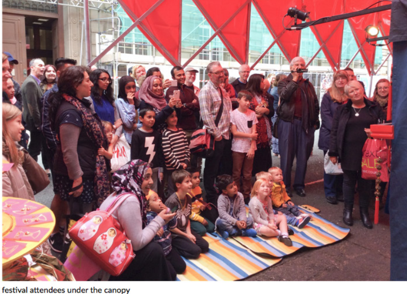
festival attendees under the canopy