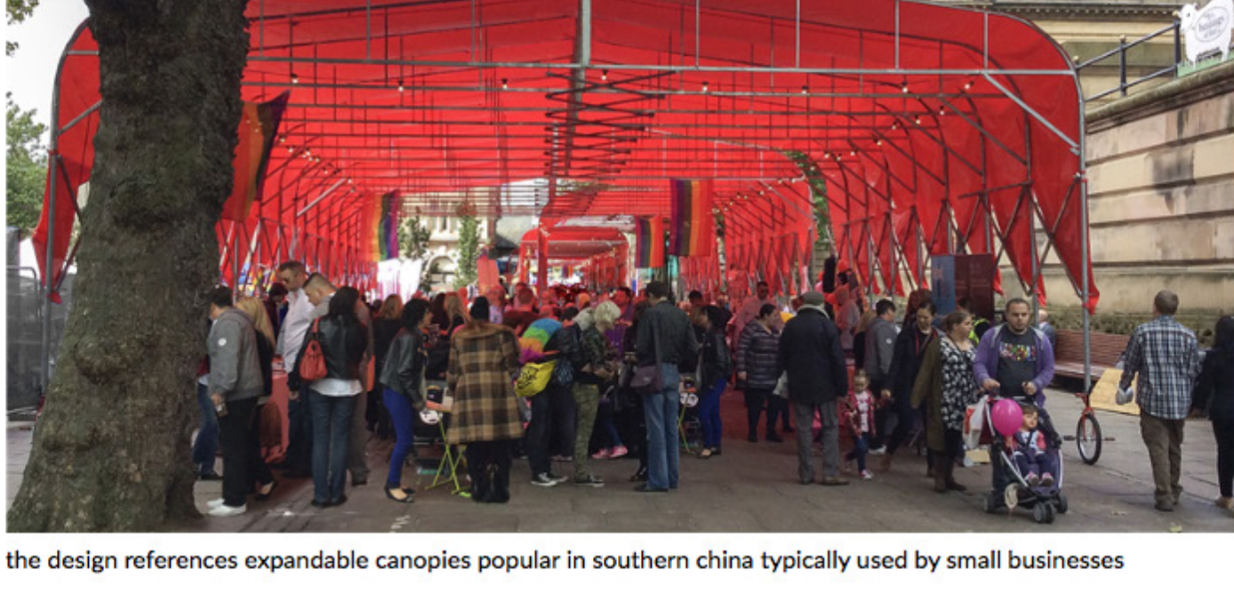
the design references expandable canopies popular in southern china typically used by small businesses