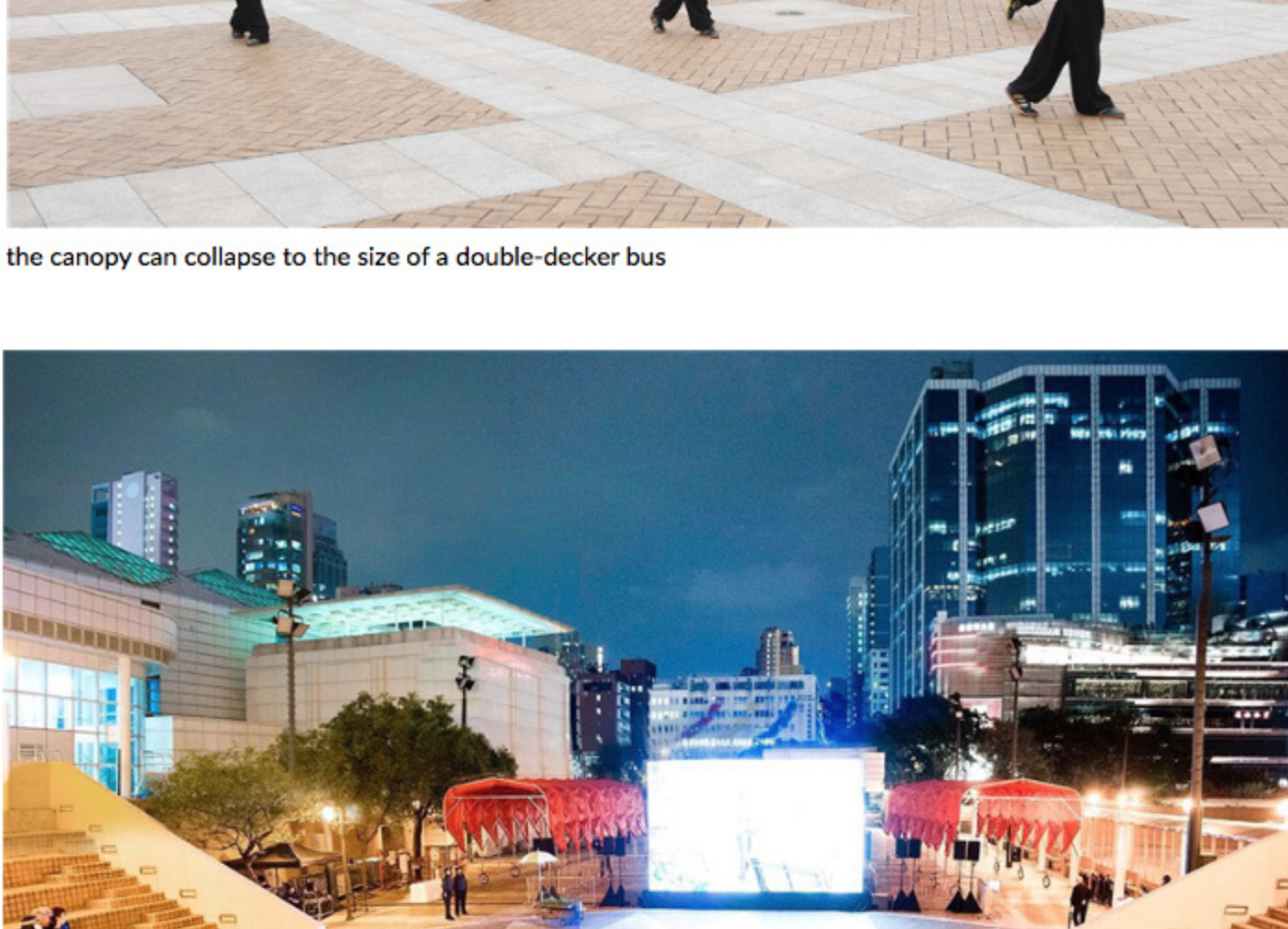
film screening of hong kong trilogy

project info: client: in certain places location: preston, lancashire, england date of completion: september 2015 principal: he zhe, james shen, zang feng project team: xu xi, jiang hao, charlotte yu