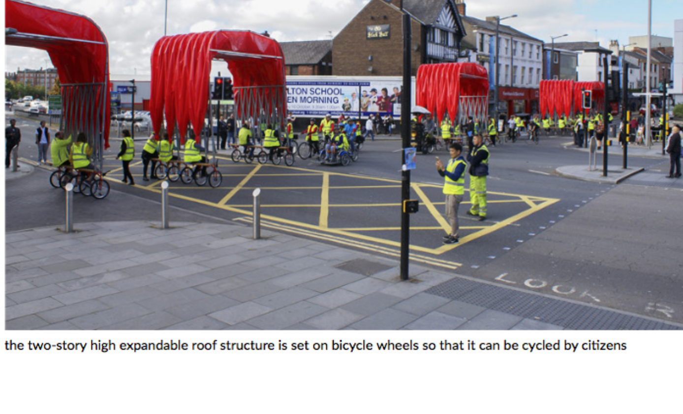
the two-story high expandable roof structure is set on bicycle wheels so that it can be cycled by citizens

designed by beijing's people's architecture office, the 'people's canopy' is thought as architecture for events and architecture as an event in itself. the two-story high expandable roof structure is set on bicycle wheels so that it can be cycled by citizens, paraded around the city, and stretched to the length of entire streets, linking disconnected public spaces. the canopy can collapse to the size of a double-decker bus so that it can be pedaled from one location to another. when parked, it can be opened like an accordion to 12-meters in length at a span of ten meters, thus turning unused areas into ones for pedestrians and events.