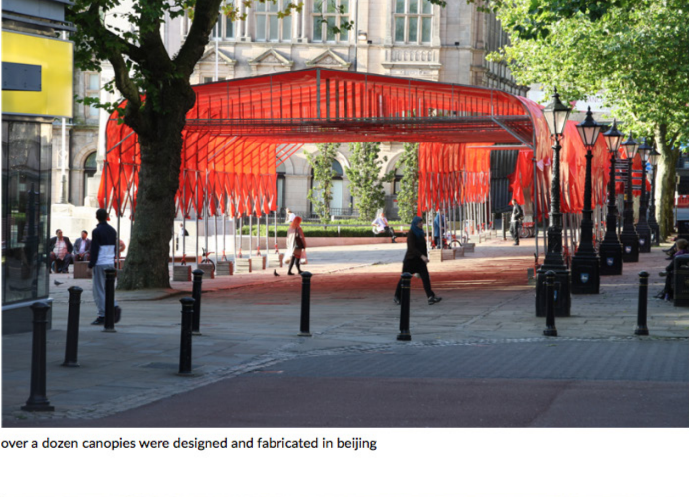
over a dozen canopies were designed and fabricated in beijing