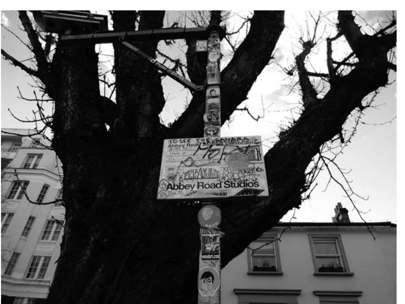
Figure 6.1 Abbey Road studios