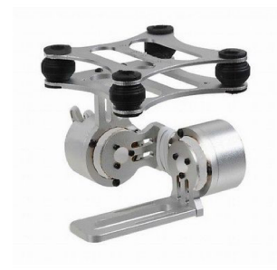
Figure 3. 2-axis gimbal used for projection stabilization.