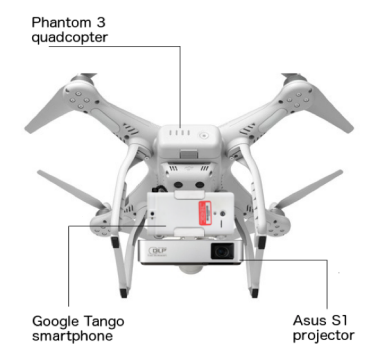
Figure 4. Drone configuration: Phantom 3 quadcopter, Asus S1 projector, and Google Tango.

carried by the drone is used to perform three tasks: (i) project graphics onto arbitrary surfaces, (ii) enable interaction within the projected surface through motion tracking (e.g. track players movement), and (iii) enable interaction through players' mobile device (e.g. calling the platform to a desired location, selecting games). To support projecting a game surface, the drone also needs to be capable of precise hovering over a certain location with minimal drift (e.g. locking position using vision based tracking).