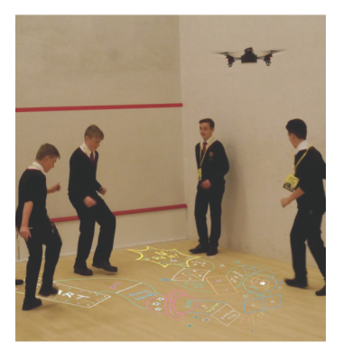
Figure 5. Children playing with StreetGamez platform (this image is an illustration of the system in action).

available in the future (e.g. longer battery life, lower weight, higher brightness of projections,). Once available, we should look at ways of redesigning the system in order to improve its utility.