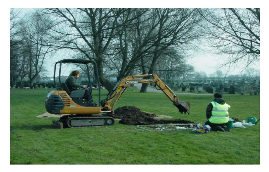
Fig. 1. Excavation of trench in Preston Cemetery beside area where Lumbricus terrestris burrows have been located and cast with coloured polyurethane resin