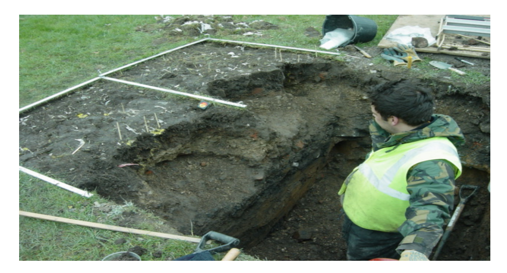
Fig. 2. Excavation of soil from within a trench to expose the marked, polyurethane-filled burrows of Lumbricus terrestris in Preston Cemetery